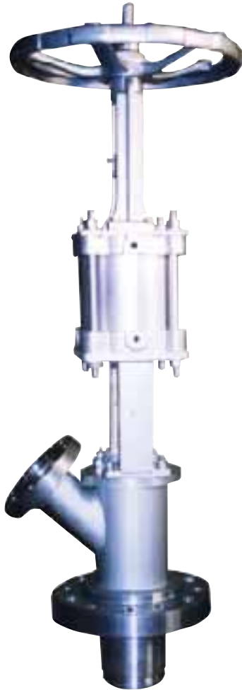
Fig No: YTV 2"x1/2"~ 12"x10"