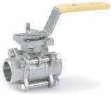
Fig no. VF-158S 1/2" - 4" (DN15- DN100)