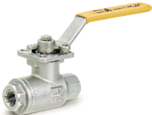
Fig No. HPV-84 Reduced Bore 1/4" ~ 2" DN 8- 50