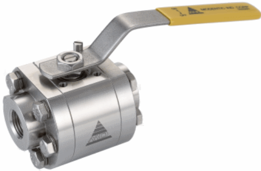
Fig no. HPV-41A Reduced Bore 1/4" ~ 2" DN 8- DN 50