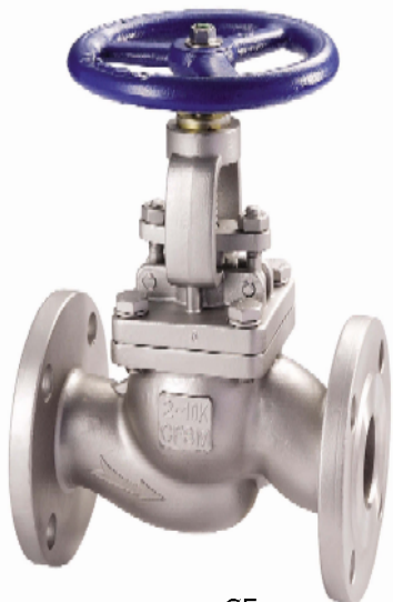
Fig no. GBF-300 1/2" - 4" (DN15- DN300)