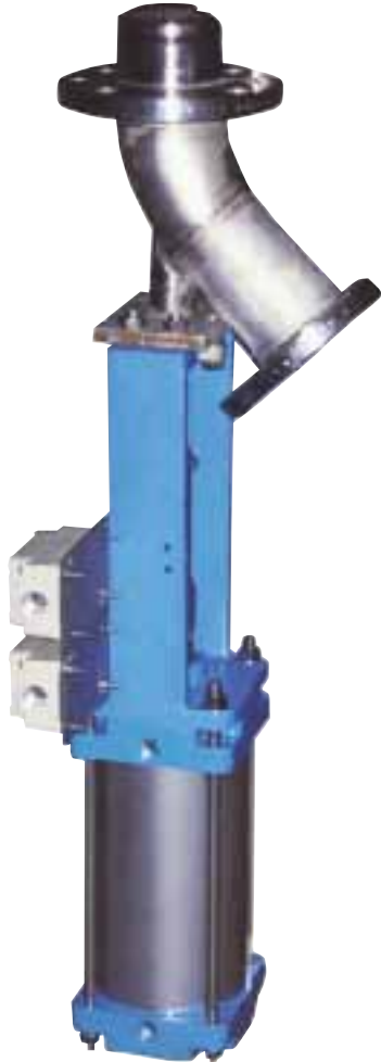
Fig No: DA-YTV 2"x1/2"~ 12"x10"