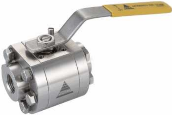
Fig no. HPV-40FS Reduced Bore 1/4" - 2" DN8 - DN50