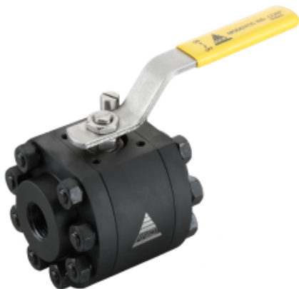
Fig no. HPV-41AS Reduced Bore 1/4" ~ 2" DN 8- DN 50