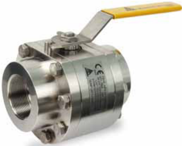
Fig No: HPV41 Reduced Bore 1/4"~ 2" DN8 ~ DN50