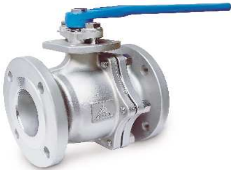
Fig No. MD-52FS Full Bore 1/2" - 6" DN 15 ~ DN 150